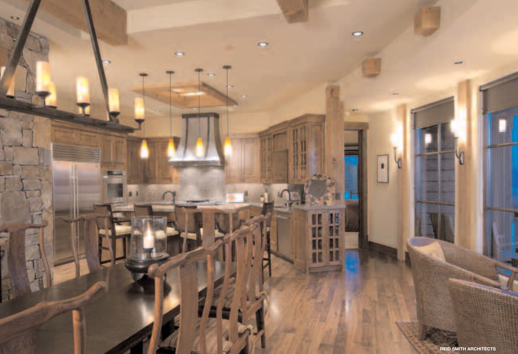
REID SMITH ARCHITECTS