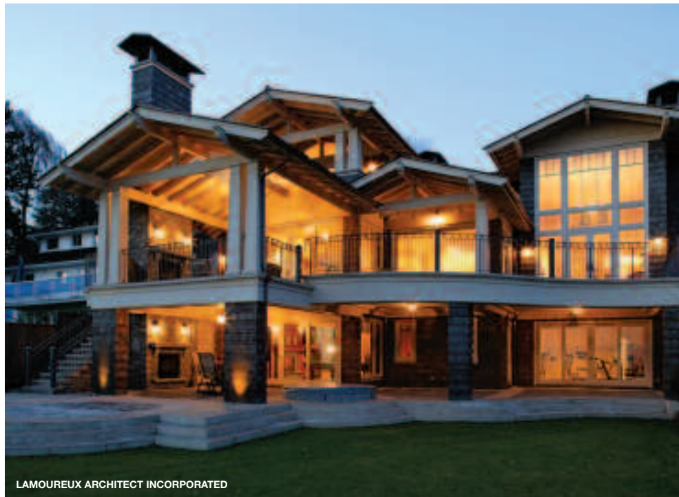
LAMOUREUX ARCHITECT INCORPORATED